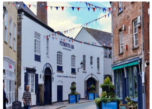
Plymouth Gin Distillery

Day 4: Continue along the Jurassic Coast and stop for photos at your leisure of Chesil Beach or Durdle Door. Maybe stop at a beach to see if you can find one of the many fossils along this coastline. Cross Dartmoor National Park, and stop in one of