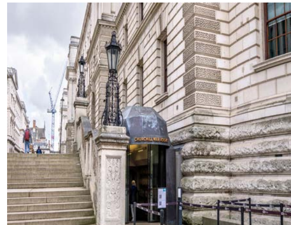
Churchill War Rooms

We will leave each other with a full-day of WWII history behind us and a deeper knowledge of the havoc caused by the Blitz and how the local Londoners came together to rebuild the city to its former glory. We'll also gain insight into Winston Churchill and his legacy as a political strategist, and mythical figure in history.